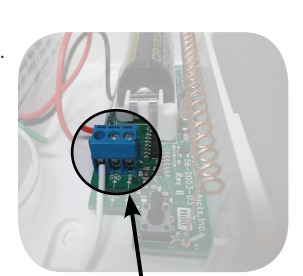
External Contact Terminal Block