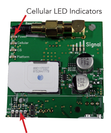
Signal Bar LEDs