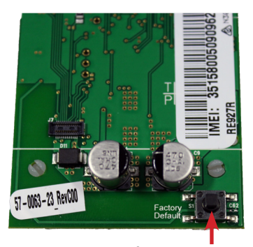
Factory Default Switch